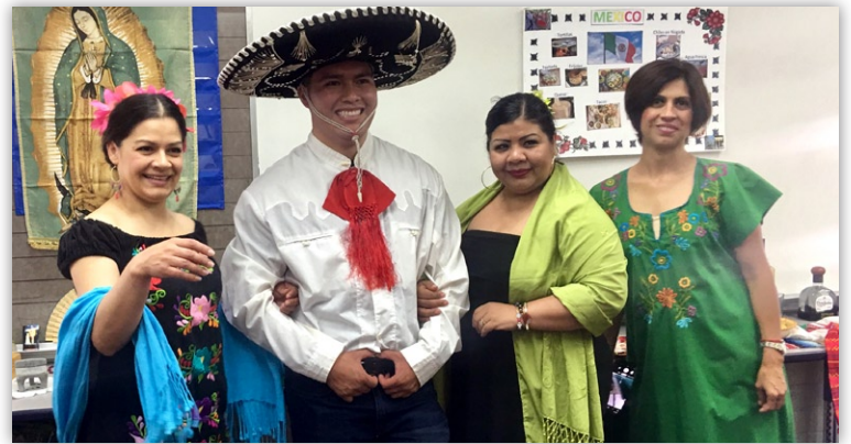
Adult School Open House Craft and Fitness Fair, October 16, 2019