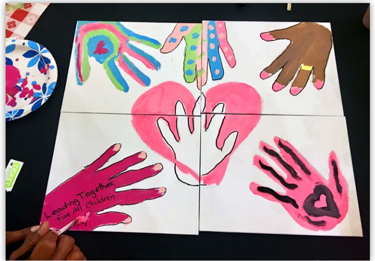
PTA Presidents and Principals Dinner, October 21, 2019