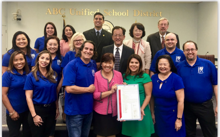
Charter Agreement Renewal, October 15, 2019