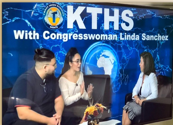
Visit to Tracy HS by Congresswoman Linda Sanchez