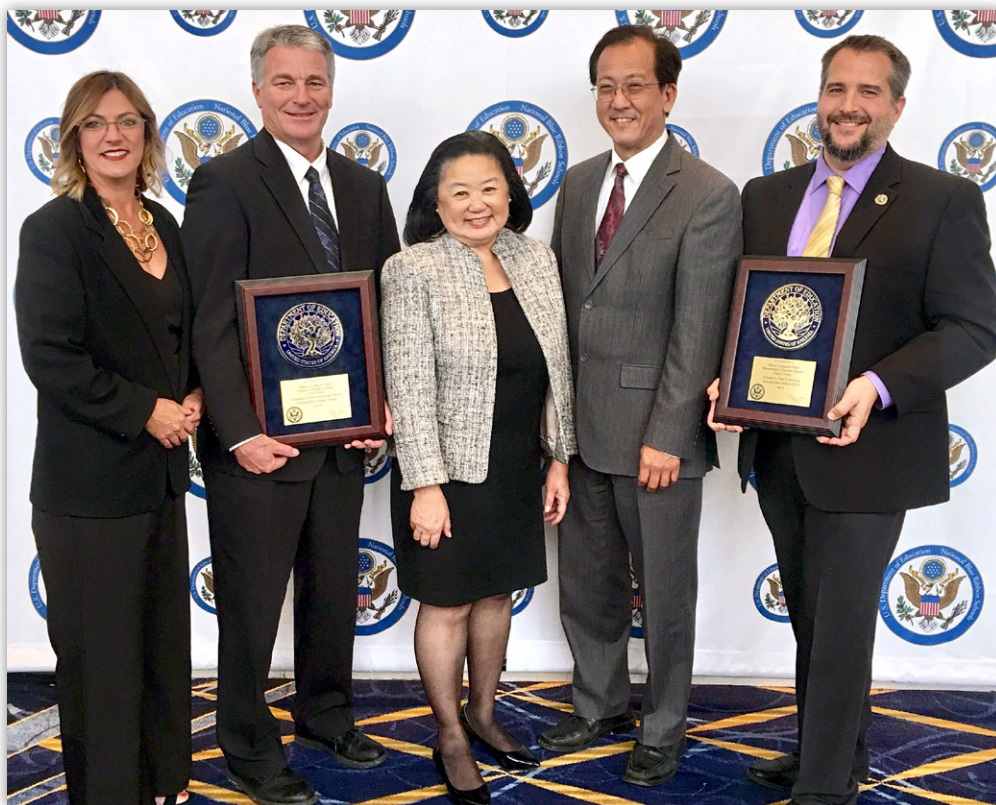
Gonsalves ES and Leal ES Recognized as National Blue Ribbon Schools

News From Our Schools and Around The District . . . . . 2-8 Community Involvement . . . . . 9