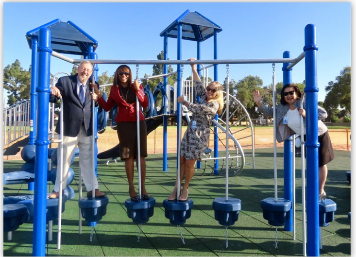
Kennedy ES Playground Grand Opening, October 28, 2019